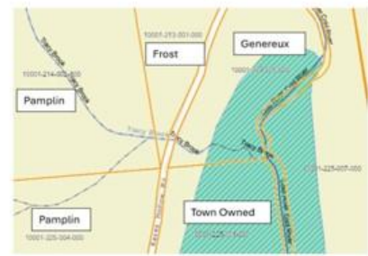
Figure 1 Site Overview Keyes Hollow Wetland Town of Acworth Conservation Commission Acworth, New Hampshire Drawn By: David Heacock Date: May 2025

Abutters Near the intersection of Tracy Brook and KHR • Pamplin 214-002, 225-004 • Frost 213-001 • Genereux 225-005 • Town Owned & SPNH – 225-006